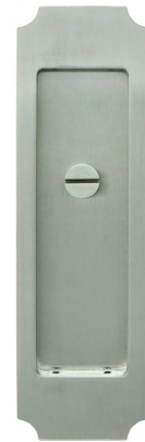
FH3204 Flush Pull w/ Thumbturn Release