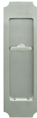
FH3282 Flush Pull w/ TT08 Thumbturn