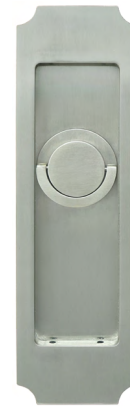
FH3292 Flush Pull w/ TT09 Thumbturn